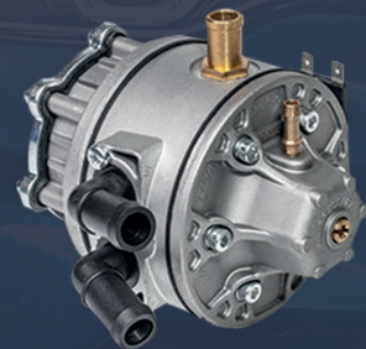
Reduktor Super (power up to 300 horses)

As well as: cable, map sensor, switch and installation kit.