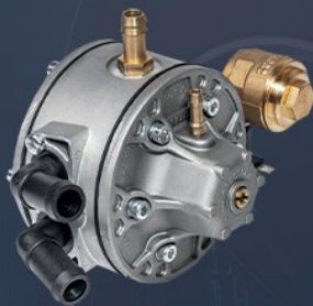
Reduktor Standard (power up to 200 horses)