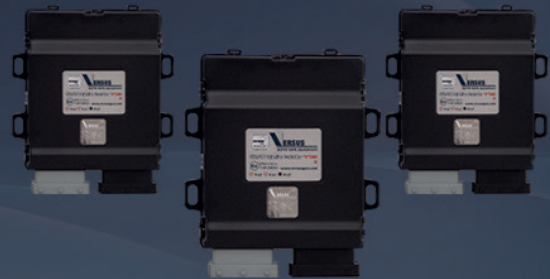
ECU V-controller (we have 4cyl., 6 cyl., and 8 cyl.) with built-in OBD function