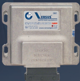
ECU F-controller (only 4 cyl. version) without built-in OBD function